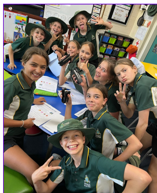
The excitement is building for our Year 6 students as they near the end of their primary years. Pictured here helping with Graduation Party invite preparation.